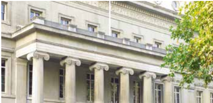
Royal College of Surgeons, UK