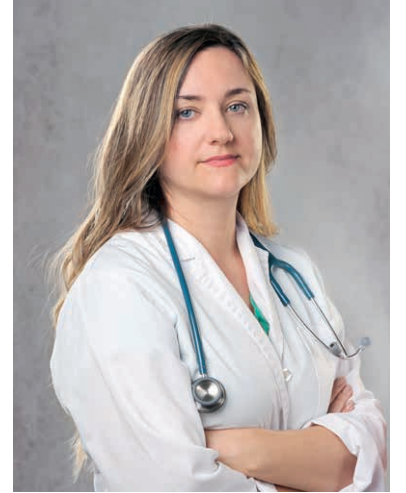
"B. Braun is a trustworthy partner, and the work experience here, with the competence of all employees, allows me fulfillment of professional goals in a healthy working environment."