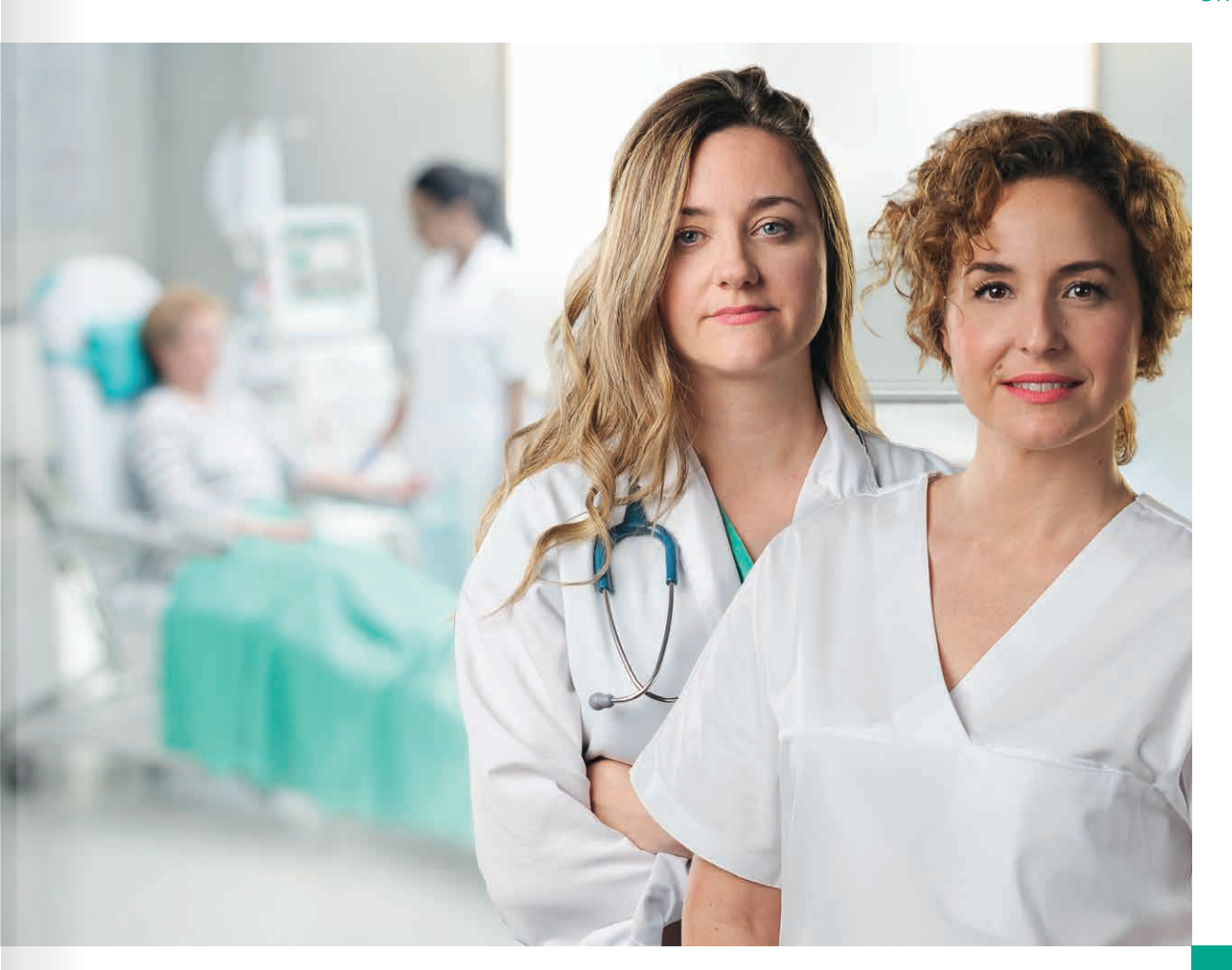
YOUR TIME TO CARE