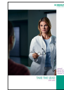
Skin Care brochure