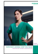
Prevention and Treatment of Wound Infection brochure