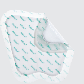
Askina® DresSil® Sacrum

Hydrophilic foam dressings Anatomically shaped hydrocellular heel dressing